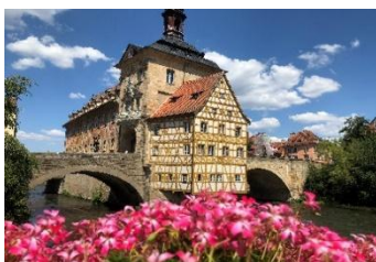
Bamberg's old City Hall